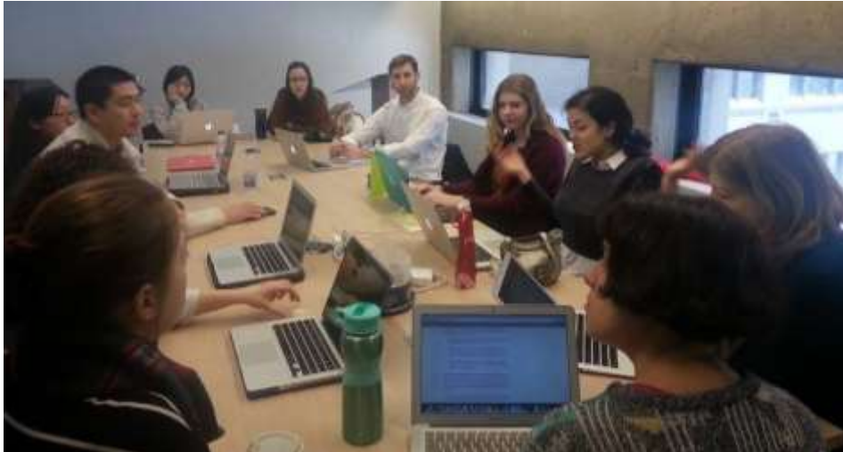
McGill student volunteers at a Sunday morning meeting

Many new student and other volunteers began in 2014, joining a strong force of professionals and university student interns working under the supervision of board members, committee members, and the executive director.