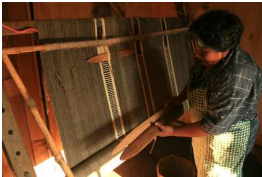
A Mapuche woman using a wixal , a traditional loom